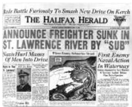
HALIFAX HERALD, MAY 13, 1942.

immediate, threatening, and very real. The Battle of the Gulf of St. Lawrence was part of a larger conflict called The Battle of the Atlantic which included all of the Atlantic Ocean between North America and Europe, and was fought between 1939 and 1945.