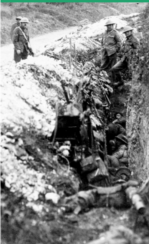
St. John's Road Trench, 1916

The Newfoundland Regiment—a unit of the British Army—first saw action in the Gallipoli campaign in Turkey. The regiment was then sent to France's Western Front for the opening day of the Battle of the Somme.